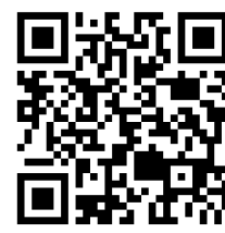
Find out more information here about the MOVE Health Clinic

No referral necessary. Rebates may be available.